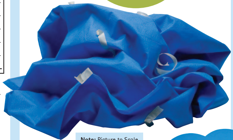
Note: Picture to Scale

Lowers your operating expense and allows your facility to do more within budget.